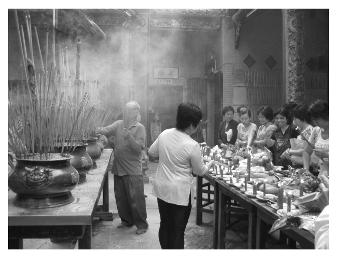
<br/> <Figure 5> People worshipping Tianhou.

Poorer people offer the goddess incense, cooking oil, and some money<sup>11</sup>. On festival days, the clubhouse committee usually appoints its female members to perform rituals for prayer. In this case, pilgrims give their offerings to Chinese women at the central shrine. These women receive offerings and pour more oil into seven-top-kerosene lamps before making vows. They vow either in Chinese, if they are Chinese, or in Vietnamese if they are of the Kinh people. Here, people usually buy many towels and baby-shirts to ask for Mother Tianhou's stamp so that those who use them will always be in good health, peace, and blessed with good luck (see figure 5).