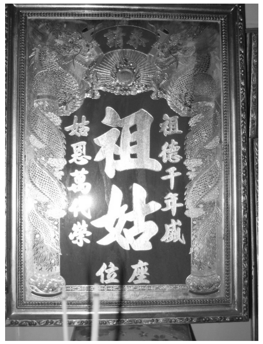
<Figure 8> The painting of the Great Grandmother. Date taken: 05/5/2011

On two sides of the tablet, there are drawing of two twisted dragons rolling around the column; their heads are facing a framing ball. This couplet can remind us of a couplet which is often found next to altars in many Kinh families in northern Vietnam: