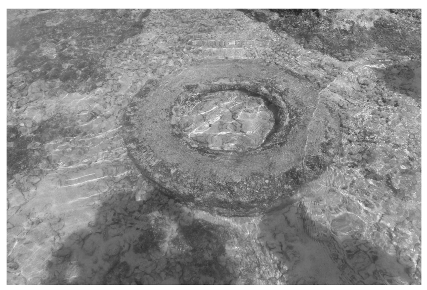
<Figure 7> A tire embedded in the sea bottom near the extremely remote Pejantan Island. It brings to mind the traces of mysterious rail tracks found on the same small island, possibly the traces of an (apparently unrealized?) fantasy of mining in the area during the colonial period.

Fishing vessels travel large distances, and they often carry some merchandise to sell or barter (mostly for fish) on islands. Even as they lack certain things common elsewhere and life is very different, island villages are mostly quite well-to-do and well taken care of, there are no slums and extreme poverty comparable to bigger cities, and people are self-conscious about both the disadvantages and advantages of living here—for many, it is a choice to stay. Rather than merely isolation—which is always there, as one side of the coin—one gets a sense that islands are connected through various networks, and there is a thriving economic activity, communication, and interchange across great distances. We were often told that our presence had become a topic of conversations several days before we arrived, and the news that proceeded us has been often enhanced as it passed from mouth to mouth; in some places, we were rumored to travel on three boats rather than one, while in another place—perhaps because one of the students had a camera drone—we were expected to arrive in a helicopter.