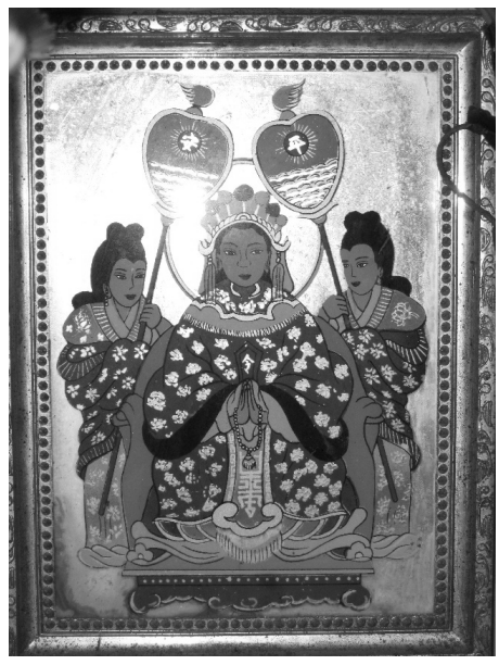
<Figure 9> The painting of Tianhou. Date taken: 05/5/2011

The Lady's blessing is greatly glorious for millions of years.