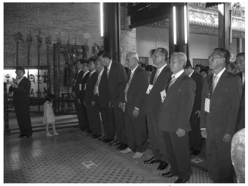
<Figure 4> A Tianhou in Tuê Thành clubhouse in Hồ Chí Minh City.

Moreover, the participans offered to the goddess typical Chinese cuisine, such as the so-called "bánh quy", sea crab, stir-fried rice noodle, dumplings, and pudding, all of which were presented alongside burning incense, candles, flowers, and fruits.