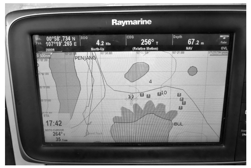
<Figure 3> Finding way through the Tambelan Archipelago (Riau Islands Province, Indonesia), as seen on electronic marine chart, which depicts remote areas such as this extremely inaccurately, as seamen love to demonstrate. The line shows the ship's track, and the danger marks were added by us. Photo by the author, taken on an NUS student voyage, 2018.

only to turn, moments later, into treacherous straights, and one is constantly aware that some danger may be at the moment invisible.