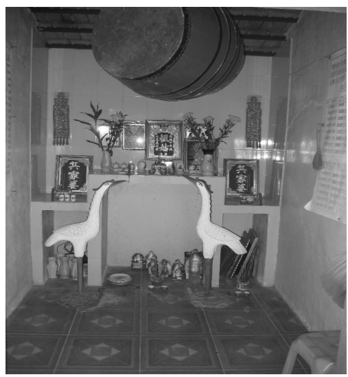
<Figure 7> A small shrine that is dedicated to Tianhou, the Holy Mother of the Realm, Great Grandmother, the Lady of Five Elements, and Avalokiteśvara the Land God, the God of wealth. Date taken: 05/5/2011

祖德千年盛 Tổ đức thiên niên thịnh 姑恩万代荣 Cô ân vạn đại vinh.