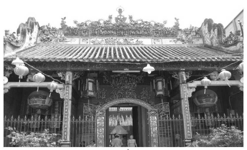
<Figure 3> Tuệ Thành assembly hall in Hồ Chí Minh City. Date taken: 04/23/2011.

Many Chinese characters are honored in the Clubhouse, including Mazu, Caishen (God of Wealth), "Hoa ông" (Chinese Gentlemen), "Hoa bà" (Chinese Lady), Tudigong (Lord of the Soil and the Ground), Longmu niangniang (Queen of the Heavenly Water Palace), Avalokiteśvara, Guan Yu, Fude zhengshen (Lords of Mercy and Happiness), and Môn quan vương tả (Lord of Gate).