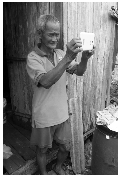
<Figure 5> The old man living alone on the Kapahiang Island (Badas Archipelago), taking a picture of the NUS group with his smartphone.

"theirs" were quickly shattered. I think of that old Chinese man who has lived his whole life, and for the last several decades all alone, on an island in the small Badas Archipelago. He is occasionally visited by people from other islands, among whom he has become something of a legend. We heard stories about his spirit wife, ghosts of dead children appearing on his island, and people being pulled under water by a mysterious force nearby. After we talked to