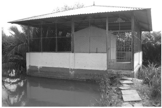
<Figure 6> The Tianhou Temple in Phước Kiến village, Nhà Bè district, Hồ Chí Minh City. Source: Phan Thi Hoa Ly, Date taken: 05/4/2011.

Kiển's primary industry, only to be reduced by urbanization. The joss house temple is very small, just 2x2.5 m in size; it is located in a hut built in the center of a lake (see figure 6). At the entrance gate, there is a signboard, which says "the Nhà Bè ward - Vietnamese Fatherland Front of Phước Kiển commune – Shrine of the Tianhou Goddess – Holy Mother of the Realm, the Great Grandmother, Lady of Five Elements." The signboard is filled with the names of goddesses worshipped at the temple. The local government's involvement in managing this shrine is visible. The shrine faces west and it was constructed with bricks, painted with lime, and covered with tiles. The gates and doors of the shrine were designed by Mr. L.M.Đ. He drew some string flowers and painted a few Sino-Vietnamese verses to accompany them.