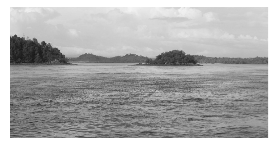
<Figure 2> Land-seascape in Riau Islands, Indonesia. Photo by the author, taken on an NUS student voyage, 2017.

"pencil dots" and long coastlines—and in some areas the sea is a maze of waterways through dense archipelagoes. In such seascape, tidal currents tend to be particularly strong, and both wind and currents tend to be especially variable in direction and speed, with various forms of dangers created by multiple currents, and "overfalls" where wind-driven waves crash against tidal currents. Weather, too, is archipelagic, with unpredictable brief squalls and highly localized and quickly-changing weather patterns more important than extensive weather systems. In the narrow straights between islands, in the restricted space between coasts, it often feels like sailing along a river with a very strong current, and such "rivers" can form extensive networks. In such archipelagic waters, watching islands and trying to understand their configurations (and their effects on current, sea depth, wind, waves, etc.), is a key part of navigation and orientation, and it is a part of the experience of seeing Indonesia from the sea. As one sails through an archipelago, configurations of islands keep changing,