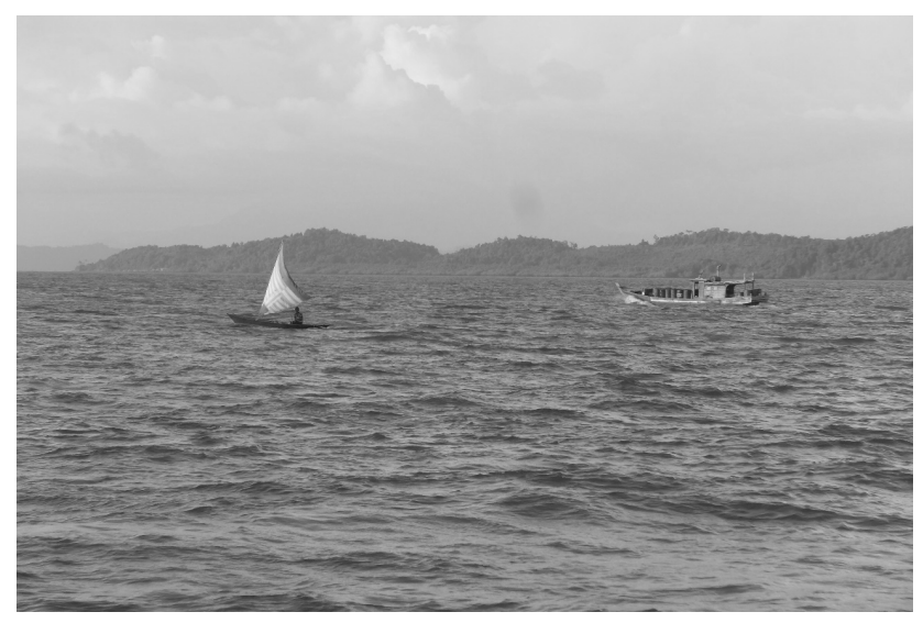
<Figure 4> A small sailboat and a cargo motorboat, Riau Islands, Indonesia. Near islands or within island clusters, one-person boats (made of wood or plastic barrels) propelled by paddles and oars are also commonly used around the islands.

Imbued with the sea, more movement than position, Lapian's writings show "sea people—sea pirates—sea kings," who they are, how they are seen, and the various configurations of their relationships, from multiple, moving points of view. For example, in the case of "pirates," he introduces a colonial view of piracy as a "criminal phenomenon." He discusses pirates as a colonial category, emphasizing the subjectivity and the politics of the colonial perspective and categorization ("actions that they grouped in the category of sea pirates"; 2011: 3-4). He then moves to a contrasting view, resulting from "the process of decolonizing of our history writing," in which pirates are seen as "rebels against colonial regime, as freedom fighters and national heroes" and the conflicts of nineteenth century as "a maritime guerrilla war" (2011: 5). "Such view [pandangan: also gaze, look] approaches the problem from the opposite direction," but "reversing our view/gaze [pandangan] like that does not mean yet that we have achieved an Indonesia-centric view [pandangan]. Fundamentally this approach is still based on European vision [visi], only the eyesight [penglihatan] is reversed. It