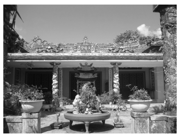
<Figure 1> The Tianhou temple in Minh Hương village, Thừa Thiên –Huế province. Date taken: 10/2/2014

The temple includes three chambers. The statue of Goddess Tianhou is located at the central chamber. Beside Tianhou are other local gods and spirituals, including twelve goddesses of good wishes for newborn babies, three goddesses of childbirth, and Văn Xuơng - Phúc Đức (i.e., good stars in horoscope that carry prosperity and the good merits of a family). Other village headmen's cults are also worshipped in this place. The chamber on the right side is used to pray to the first settler of a new land ("tiền hiền"), the City God, and the village leaders of the past. The chamber on the left side is used for villagers to gather and discuss public issues. The Tianhou temple in the Minh Hương village is a complex building that embraces a holistic design of a Daoist temple, a Buddhist temple, and a Vietnamese-style communal house. It functions as a religious and cultural center of people living in the Minh Hương village today.