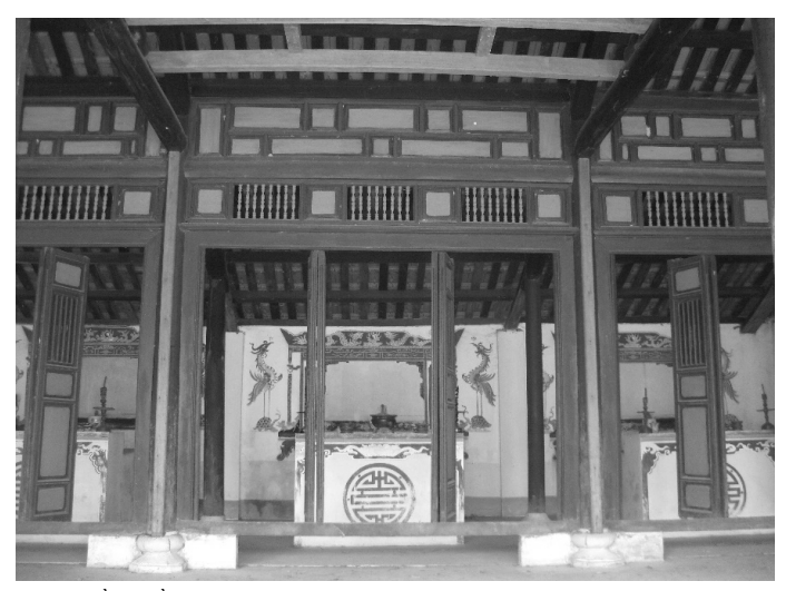
<Figure 2> "Tiền hiền" house of worship in the Tianhou Temple in Minh Hương village, Thừa Thiên –Huế province. Date taken: 10/2/2014

The results of my fieldwork in 2010 indicate that, prior to 1975, the Tianhou temple in Thua Thien-Hue organized thirteen annual rituals as followed: