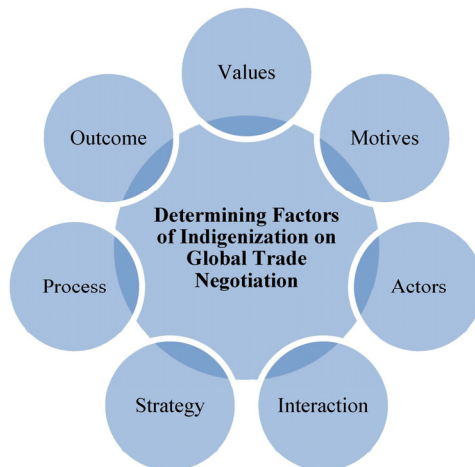
<Figure 3> Determining Factors of Indigenization on Trade Negotiation Model

This study revisits the conceptual framework in identifying trade negotiation model to measure the indigeneity of Southeast Asian automotive industry’s policy through APMRA. This study offers seven substantive variables to shape determining factors of the trade negotiation model, which include: values, motives, actors, interaction, strategy, process, and outcome. Each variable plays equally important roles in revealing the indigenous values of the negotiation model.