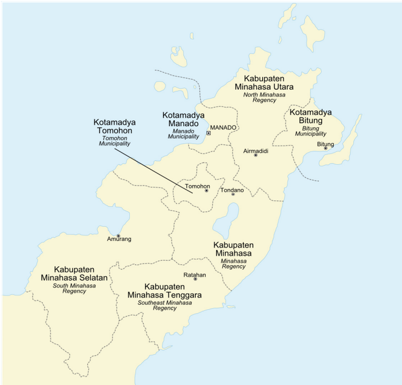
<Figure 1> The Location of Tomohon

Having discussed epistemic ‘unconsciousness’ and ‘consciousness’ in the social sciences, I will move on to talk about autobiographical experiences of the author from ethnographic field research in a Minahasan region (Tomohon) 1 , North Sulawesi, Indonesia, between June 1999 and July 2000 and then their implication to epistemic reflexivity in Southeast Asian Studies.